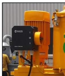
Cam Shaft Controller