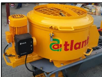
Twin Pan Mixers